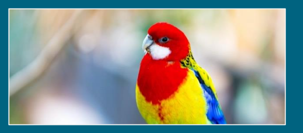
species you spot within the 20-minute period. For example, you might see 4 Australian Magpies, 2 Rainbow Lorikeets and a Sulphur-Crested Cockatoo. You can record your results online or simply download the app. The app can also be used as a field guide/ bird finder. aussiebirdcount.org.au

To complete the Aussie Backyard Bird Count, spend 20 minutes standing or sitting in one spot and noting down the birds that you see. You will need to count the number of each