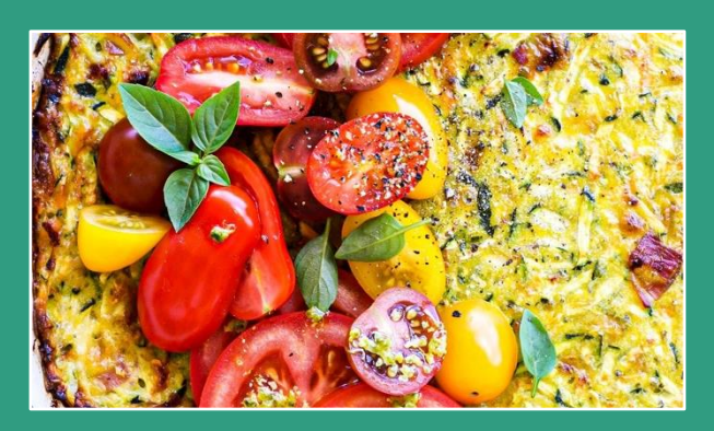
PREP 15 min | COOK 45 min | SERVES 8-10